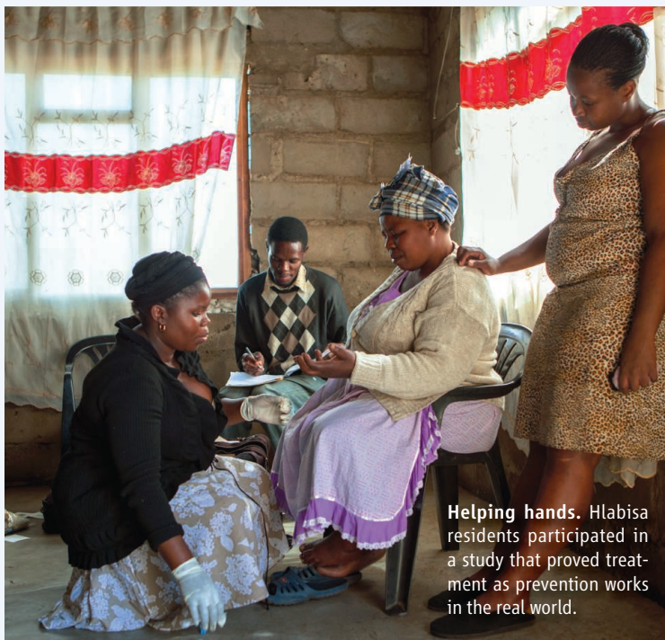
Helping hands. Hlabisa residents participated in a study that proved treatment as prevention works in the real world.

Researchers at the Africa Centre had previously shown that sexual partnerships in Hlabisa have strong geographical links. In a study published by Tanser and colleagues in the 16 July 2011 issue of The Lancet , 67% of the participants reported having sex over a 5-year period with someone in their small Zulu community known as an isigodi . So for the new study, the investigators created a circle around each uninfected person's home that had a radius of 3 kilometers and then analyzed the proportion of HIV-infected people receiving ARVs in that small area. If treatment worked as prevention on a community level, then, theoretically, there should be fewer new infections in neighborhoods where a higher percentage of infected people were on ARVs.