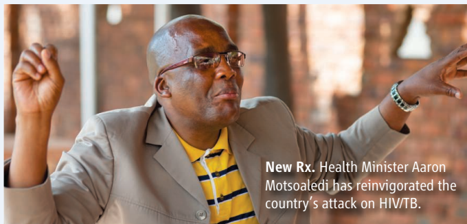
New Rx. Health Minister Aaron Motsoaledi has reinvigorated the country’s attack on HIV/TB.

Motsoaledi met with Science in September 2012 in the courtyard of an aging but elegant conference center atop a hill in Pretoria. The center was hosting President Zuma and other leaders attending an African National Congress (ANC) meeting. An executive member of ANC who during the anti-apartheid struggle once worked with an underground, armed wing, Motsoaledi was candid and refreshingly blunt, never sidestepping controversial issues or requesting that his thoughts be off the record.